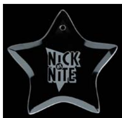
Example of finished etched ornament (ribbon not shown)

Limited quantity available! Orders will be taken until we are sold out! Orders may be picked up at the Lisa Alexander Meet December 3-4, picked-up at the Synchro Ontario office or shipped to you (extra cost).