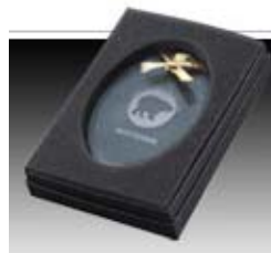
Ornament comes in a black gift box

Please note we require payment to secure your pre-order (cheque or credit card)