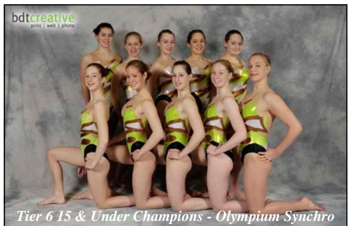
Tier 6 15 & Under Champions - Olympium Synchro