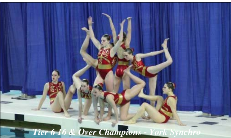
Tier 6 16 & Over Champions - York Synchro

Complete results are available on the Synchro Ontario ( www.SynchrOntario.com ) and Synchro Canada ( www.synchro.ca ) websites.