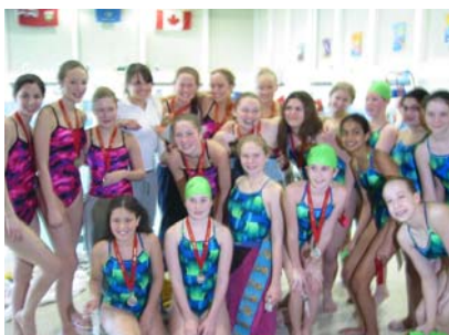
CISAA Champions - St. Mildred's