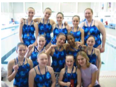
CISAA 2nd Place - Trafalgar Castle