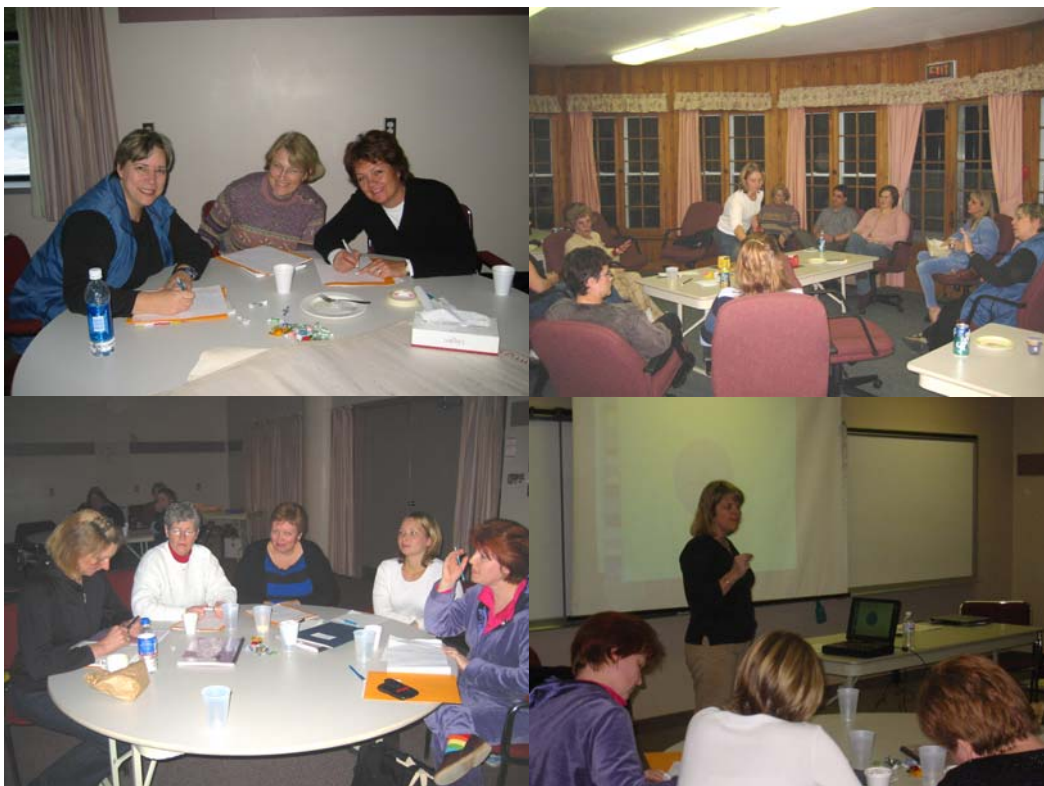
Officials participated in technical development sessions and a fun social on Saturday night.