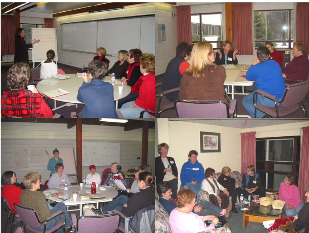
Club Presidents from Synchro Ontario competitive clubs participated in interactive group discussion sessions regarding club development topics, and enjoyed a Saturday night social together after a long day of hard work!