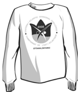
Back (large logo center)