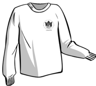
Front (small logo left)